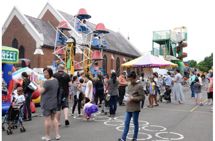
2016 Parish Fair

Keep your eye out on our Parish Facebook Page and the Parish Bulletin as we provide more information. We are seeking volunteers who may wish to run a stall, showcase a talent, possibly donate goods or sponsor the event.